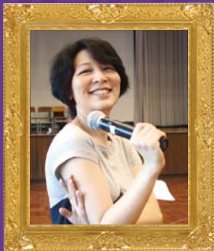
Message from Director

A blue caterpillar smoking a hookah, a cat with a grin that looks like the crescent moon, a mad hatter. Over the years these characters have delighted us. Even if you don't know Lewis Carroll's story, you are sure to know that they are characters from his classic tale of a girl's adventure in Wonderland. Of course, there is this girl called Alice, who has come to embody the very idea of a child's boundless imagination.