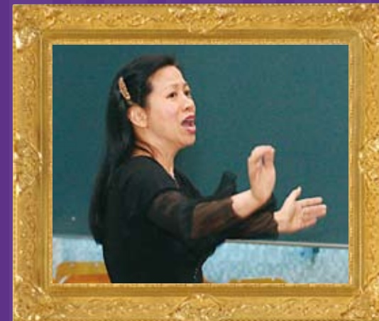
Message from Music Director

“Gesamtkunstwerk” is a term used by the 19th Century German Romantic composer, Wilhelm Richard Wagner, to signify an ideal operatic performance that synthesizes all the arts, including the performing arts like music, theater, dance; literature including poetry; and the visual arts like painting, sculpture, and architecture.