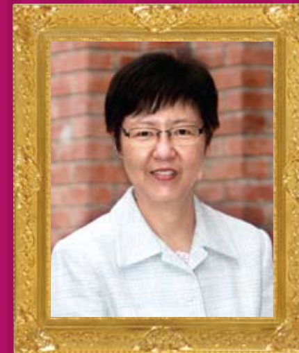
Message from Principal

The Hong Kong Academy for Performing Arts