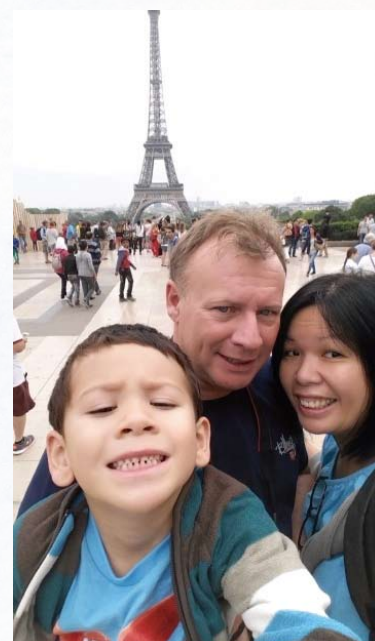
▲ Visiting Paris with my family