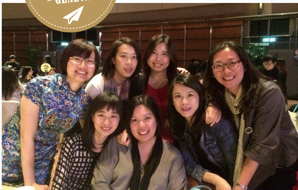
▲ At the 115th Anniversary Dinner (front row, centre)