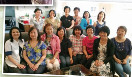
▲ 今年四月成功達致籌款目標 (前排全為1971屆校友)